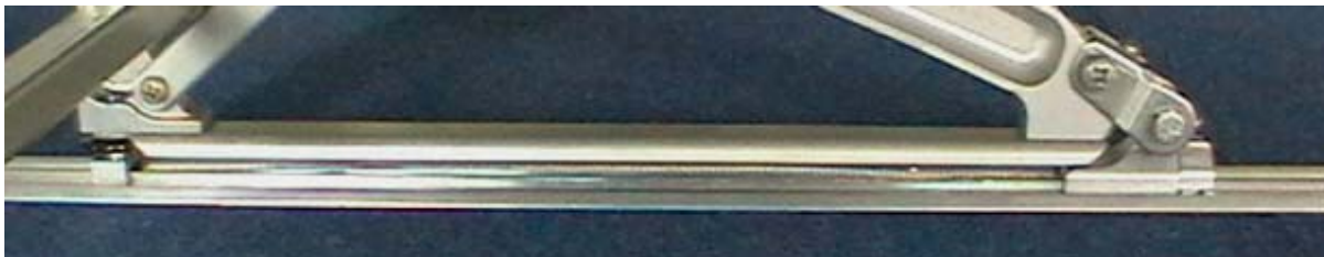
Adaptive seat rail with Front and Rear Sledges