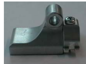
Manual Rear Fitting